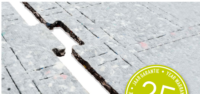
Puzzle shaped sheets with expansion slots